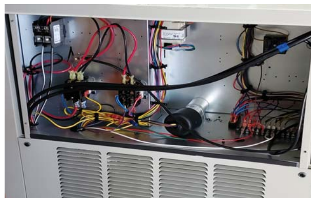
Fig. 2. Unit control compartment.