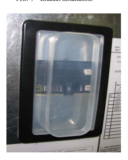
FIG. 5 - Installed breaker cover

Note: The electric heater in this system contains a manually resettable over-temperature safety limit. In the event of a "NO HEAT" limit trip, check for possible issues with dirty filters, blocked outlets, or possible fan failure prior to resetting. To reset the limit circuit, simply turn the system off at the thermostat (or at the unit power circuit breaker) and then immediately turn the system back on. If a limit reset is required more than 2 times in a short period of time, consult a service technician before reenergizing the system.