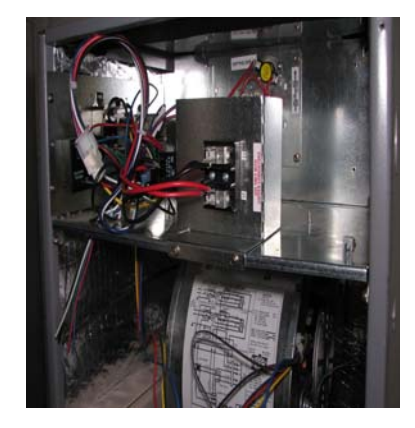
FIG. 4 - Bracket installation.