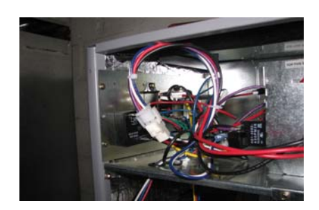
FIG. 3 – Connected (6) pin socket.