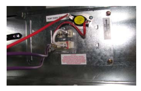
FIG. 2 - Installed heater plate.