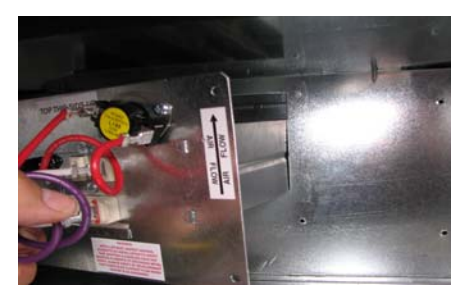
FIG. 1 - Heater assembly insertion.