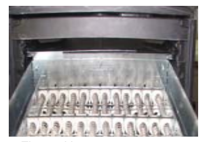
Fig. 3 - Heater recess