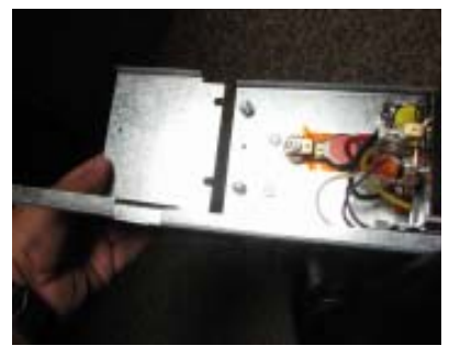
Fig. 1 - Filler plate installation.