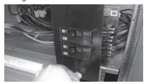
Fig. 2 - Breaker installation.