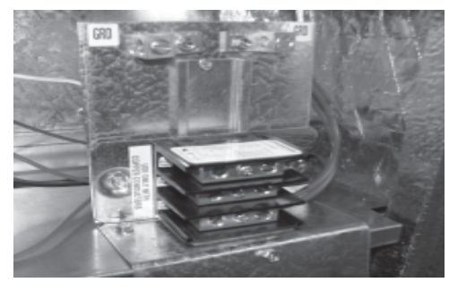
Fig. 1 - Terminal Block installation.