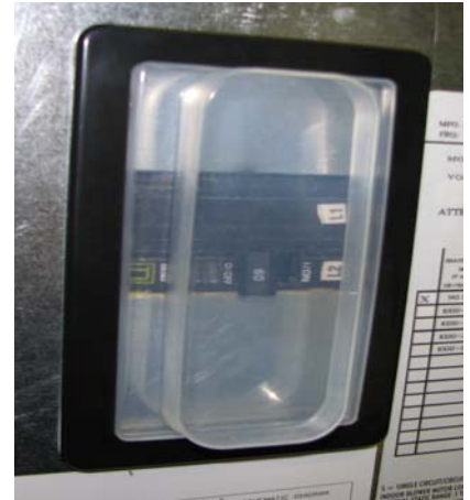
FIG. 3 - Installed breaker cover