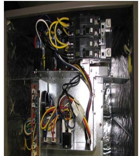
FIG. 1 – Installed Heater assembly.