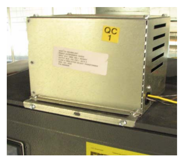
Fig. 2 – Generic autoformer installation.