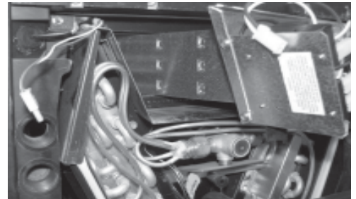
Fig. 1 - Heater frame insertion.