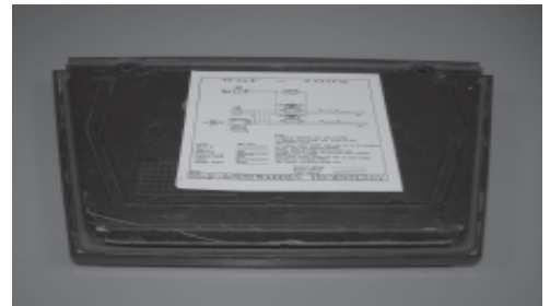
Fig. 2 - Wiring diagram on panel.