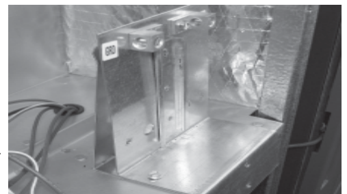
Fig. 3 - Support bracket installation.