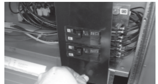
Fig. 2 - Breaker installation.